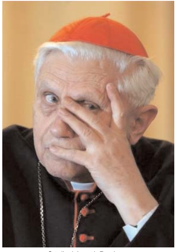
Cardinal Joseph Ratzinger.

The First Vatican Council wrote: «The Roman Catholic Church believes and confesses that there is only one